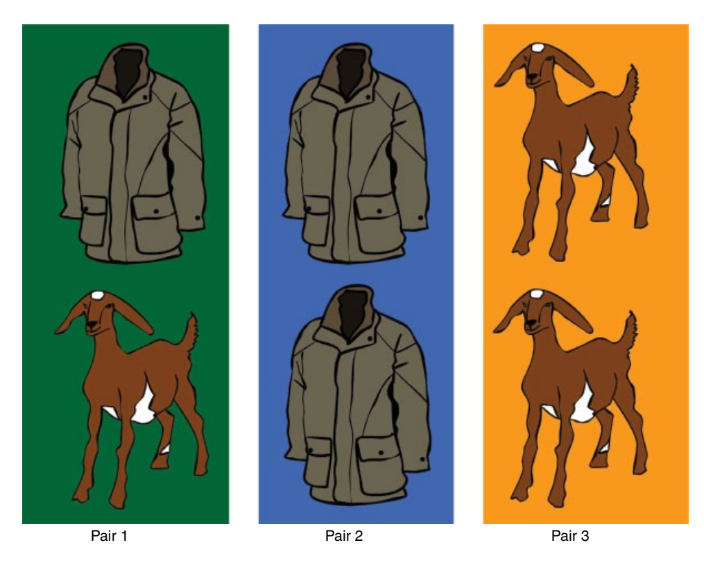
Figure 14.8 Sample prompt for English phonological discrimination.

phoneme (i.e., a minimal pair). The child must select from three possible picture pairs the correct pair that matches the words produced by the experimenter. For instance, if the experimenter says "coat" and "goat" (a minimal pair in English), the child should pick Pair 1 from the three pairs illustrated in Figure 14.8. If the experimenter says "goat" and "goat," the child should pick Pair 3.