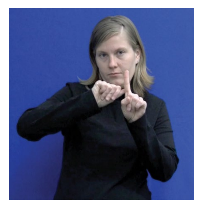
Figure 14.14 Sample prompt from the ASL pseudo-sign test.

The pseudo-sign test can be filmed at the angle shown in Figure 14.15, capturing both the stimulus video and the child's production.