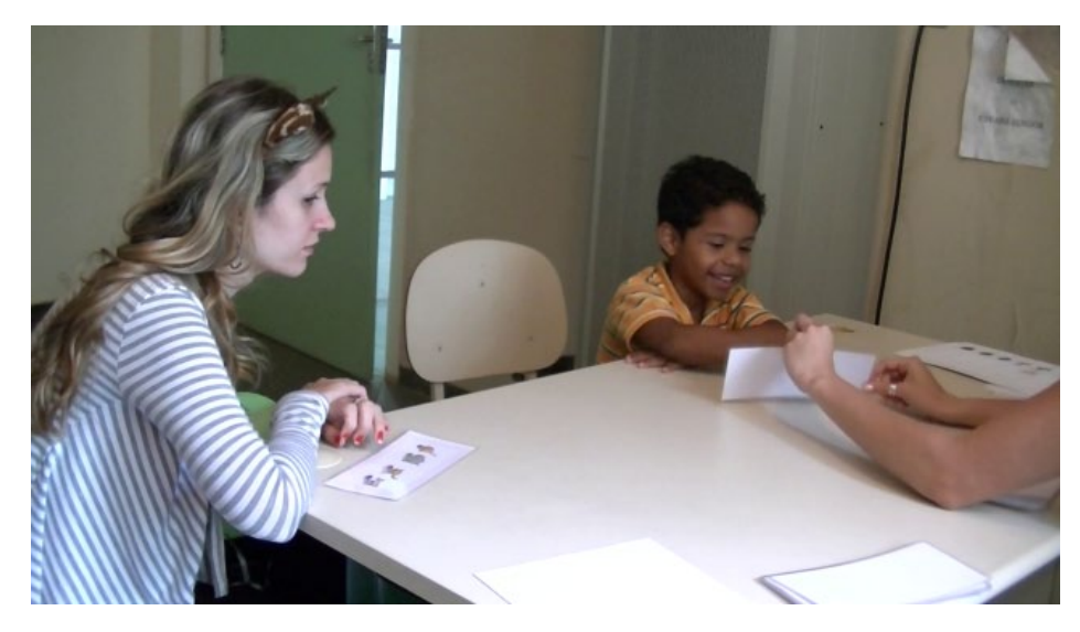
Figure 14.5 Camera angle for word order test.