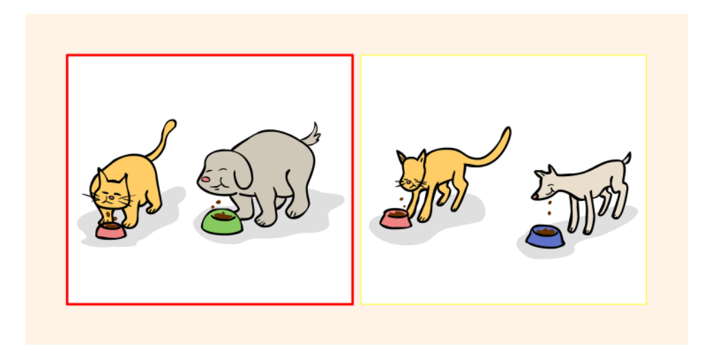
Figure 14.4 Sample prompt from word order test.

Because we use the same stimuli across all four languages for this test, each child sees the full set of pictures twice. However, the specific pictures that they are required to describe in the first testing differ from those in the second: on each card, the picture highlighted for the spoken language version of the test is the opposite of the one highlighted for the sign language version of the test. Additionally, since Libras and English are more restrictive than BP and ASL in terms of modifier–noun word order, we test children in the less restrictive language first, then in the more restrictive language after a month (or even later). This practice serves as a precaution against the possibility that test items in the first test would bias the children's word order choices in the second test.