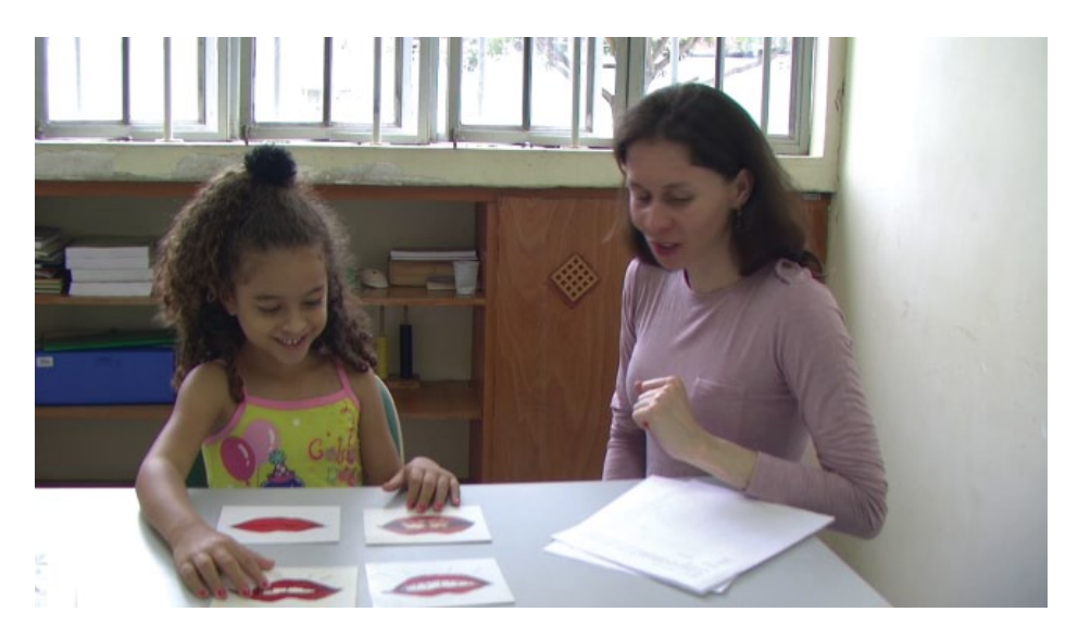
Figure 14.13 Camera angle for speech phonological awareness test.

We also film with an additional microphone and in a quiet room. If the child speaks very softly, experimenters should ask the child to repeat his/her answer more loudly, or the experimenter may repeat the child's answer, to help with later coding.