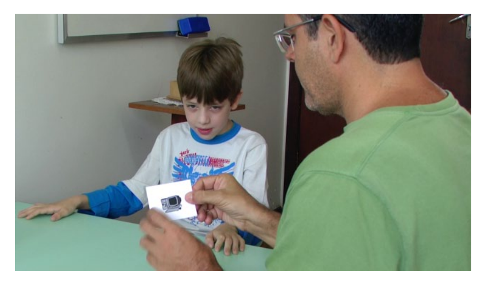
Figure 14.7 Camera angle for sign picture-naming test.