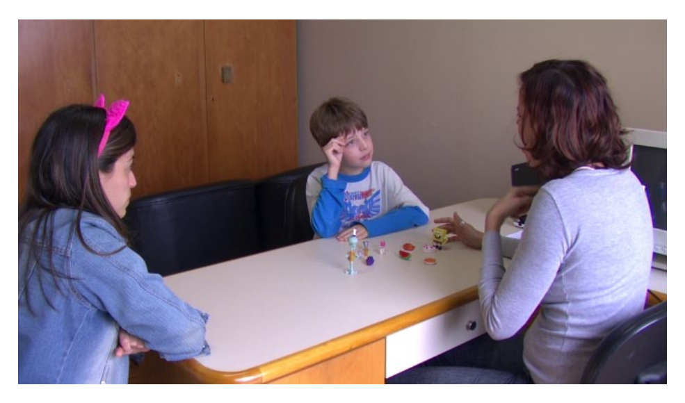
Figure 14.6 Camera angle for the wh-test.