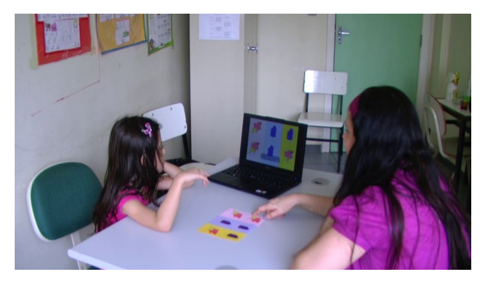
Figure 14.9 Camera angle for phonological discrimination/minimal pairs test.