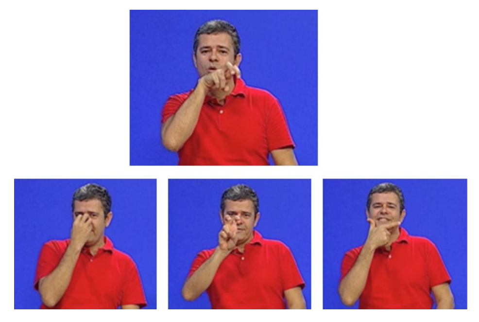
Figure 14.10 Libras signs for SERPENTE ( snake ), PALHAÇO ( clown ), CINCO ( five ), and SORRIR ( smile ).