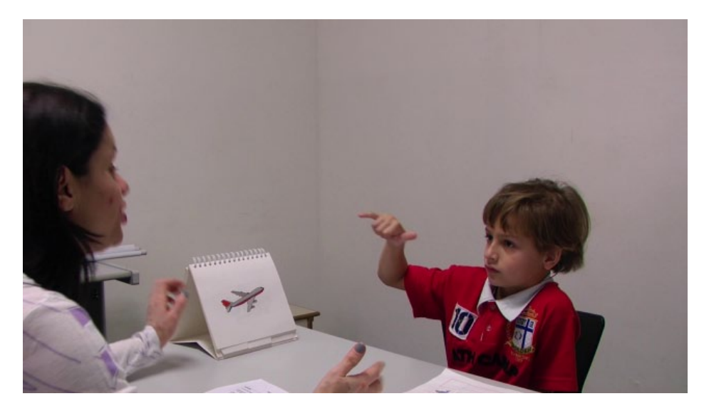
Figure 14.3 Camera angle for EVT.