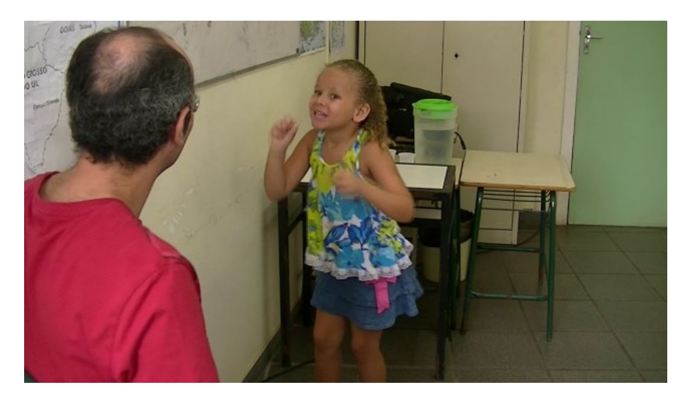
Figure 14.2 Camera angle for narrative task.

first experimenter to leave the room at the moment when the second (naïve) experimenter entered.