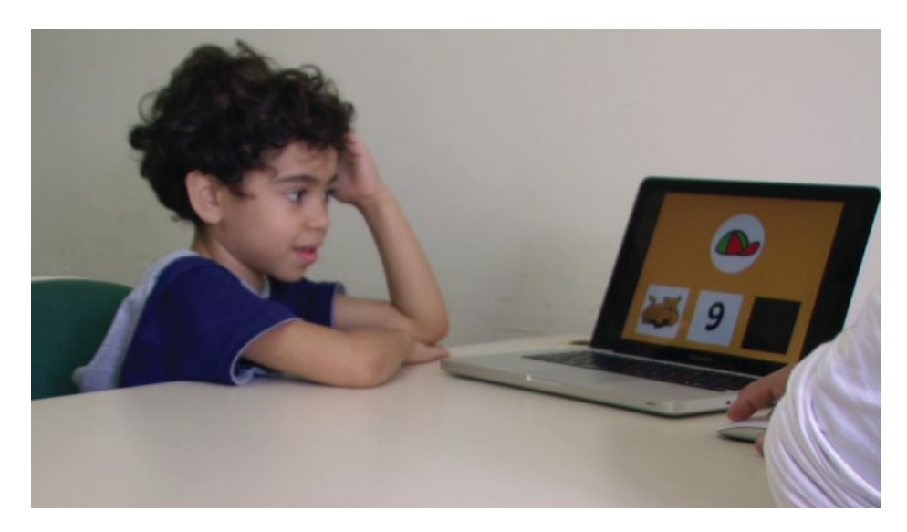
Figure 14.12 Camera angle for sign phonological awareness test.

so as to capture clearly the direction of the child's pointing, as illustrated in Figure 14.12. It is also important to include the experimenter, who can reconfirm children's selections, if these are not clearly articulated.