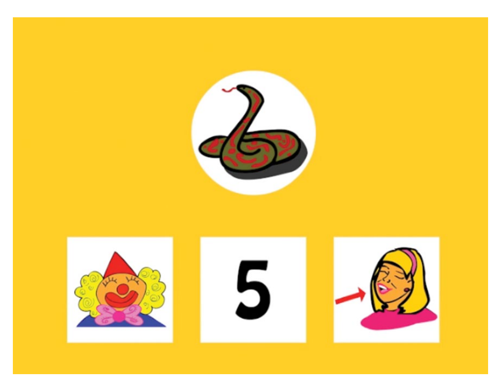
Figure 14.11 Sample prompt from Libras phonological awareness test.