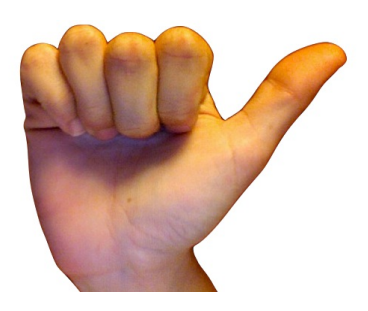
Figure 2: [A] handshape.

as crossing) and contact, if any, between the fingers and thumb. Thus, the [A] in Stokoe notation is phonetically annotated as [LEE < 1FF = 2FF = 3FFe = 4FFe] in SLPA.