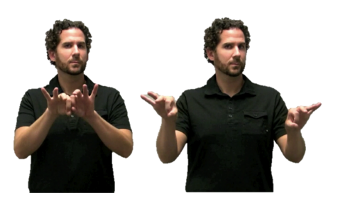
Figure 5: DS(F):long-skinny.

The third, and final, issue we will discuss here is the difficulty in assigning glosses to signs that do not have suitable translation equivalents between ASL and English. Thus far, our database does not include, classifiers, depicting signs (except for one) and other polycomponential forms, but in order for the database to reflect language use in ASL corpora, these are forms that will need to be included. Johnston (2011b) offers possible solutions, based on his work in developing an ID-glossed corpus for Auslan. He makes distinctions between signs that are fully lexical, those that are partially lexical and those that are non-lexical (e.g., gesture and emblems). For partially lexical items, or signs that are regular in form but for which the meaning is conditioned by the context of utterance, Johnston (2011b) suggests using some sort of indication of what type of partly lexical item it is (classifier, depicting signs, etc.), what handshape is used, and what does it mean in a particular context. To use Johnston's example, a partly lexical sign might be glossed DSH(F):describe-as-appropriate, where "DSH" indicates that it is a depicting sign with an "F" handshape. Another similar type of example from our database is pic-